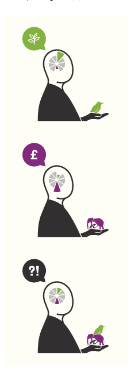
Figure 4. The see-saw effect.

On the other hand, it has been shown that when certain values are held in high regard, or when they are triggered, those on the opposite side of the circle will be held in much lower regards, or will be suppressed. For example those holding achievement in high regard will have a much lower regard for benevolence. Therefore, to strengthen achievement and power means to weaken universalism and benevolence. This is referred to as the see-saw effect (see Figure 4) (Holmes et al 2011).