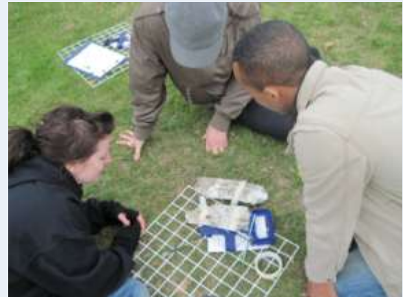
Solutions and change