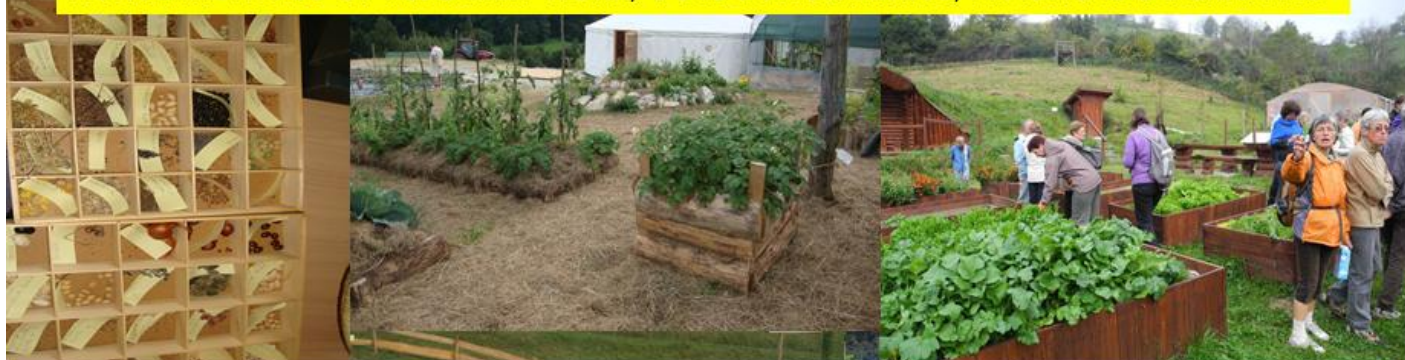
GOALS: UNDERSTANDING SUSTAINABLE FUTURE, NATURAL RESOURCES SAVING AND NATURE