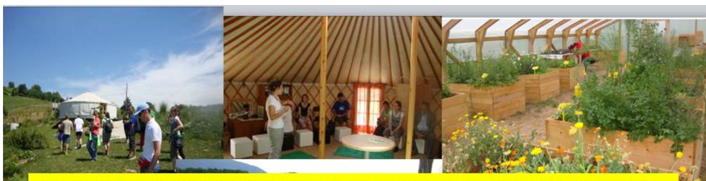
ACTIVE METHODS OF RESEARCH WORK, OUTDOOR LEARNING, PRACTICAL EXPERIENCES

☉ Frame: Being socially responsible, economically independent and generally educating for sustainable future.